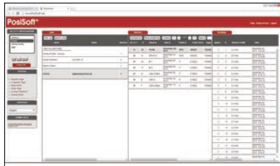
Jobs Batches Readings