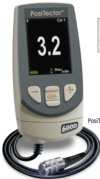
PosiTector 6000 FS3