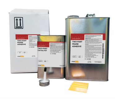
Complete DYNABOND Two-Part Frame Adhesive Kit