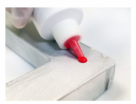
DYNABOND Two-Part Frame Adhesive used to precoat frame