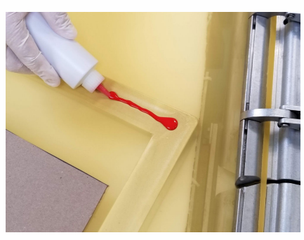
DYNABOND Two-Part Frame Adhesive used after stretching